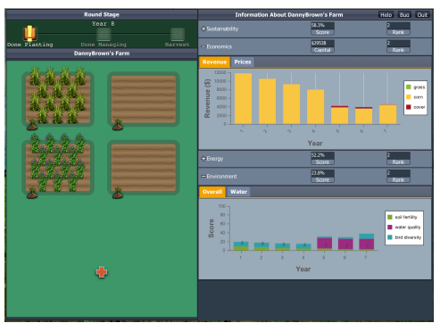
Figure 3. Screen shot of player "DannyBrown"'s farm after 7 "years" of playing the game.

Role-playing video games, essentially participatory simulations (Wilensky & Stroup, 1999) with a playful, role-based twist, provide opportunities for players to learn interconnections between individual choices and local/global sustainability processes and outcomes. We created a multi-player video game in which participants role-play as farmers by making choices about what biofuel crops to plant in their fields over time given shifting market conditions (Figure 3 shows a screen shot of the most current version of the game). Throughout multiple "years" (rounds) of play, farmers design and tinker with their fields based on their understanding of how the global system works and how to succeed in that system. That is, they make decisions on how to construct their overall farm (i.e. the ways that particular fields are planted, fertilized, or left fallow) based on their interpretations of the external, shared representations of the global environmental and economic system. It is in this sense that the game reflects the principles of constructionism (Papert, 1990; Shaw, 1996).